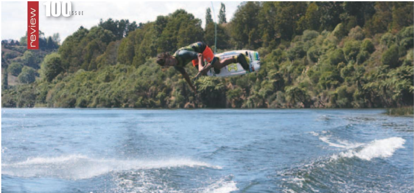
ABOVE: THE SARONIC OFFERS A NICE STEP WAKE FOR SERIOUS WAKEBOARDERS.