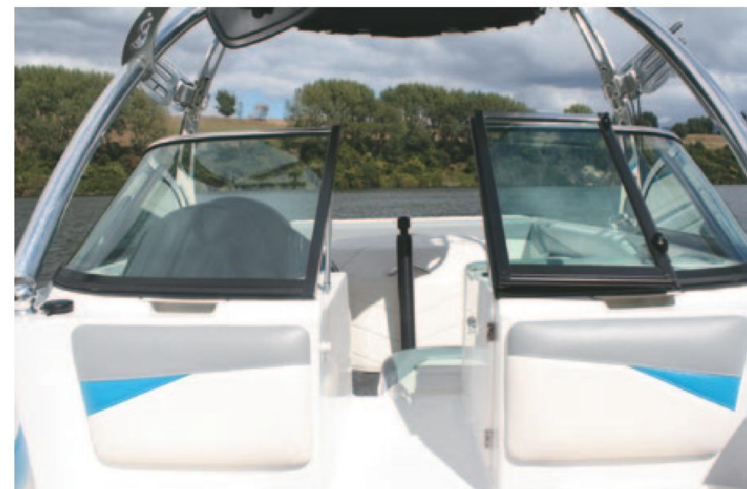
LEFT: THE SCREEN OPENING CAN BE FULLY CLOSED TO STOP ANY WIND INTO THE COCKPIT.