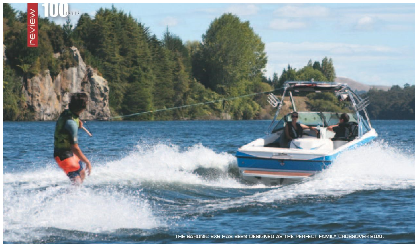
THE SARONIC SX6 HAS BEEN DESIGNED AS THE PERFECT FAMILY CROSSOVER BOAT.

BELOW: AT THE HELM, THE DRIVER'S SEAT IS FULLY ADJUSTABLE AND YOU CAN ALSO ADJUST THE STEERING WHEEL TO FIND YOUR PERFECT DRIVING POSITION.