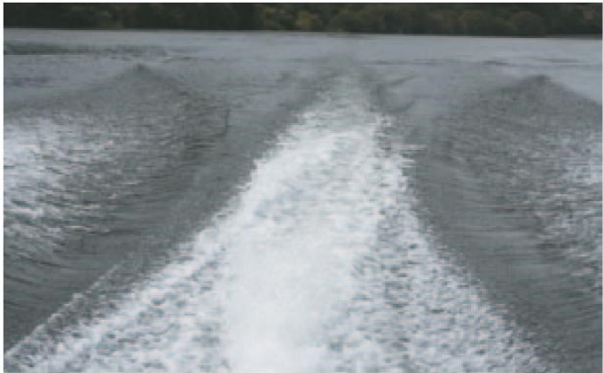
BELOW: SAME BOAT, DIFFERENT WAKES –SKI WAKE (UPPER) & WAKEBOARD WAKE (LOWER).